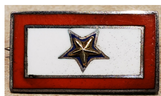
Gold Star Mother's Pin