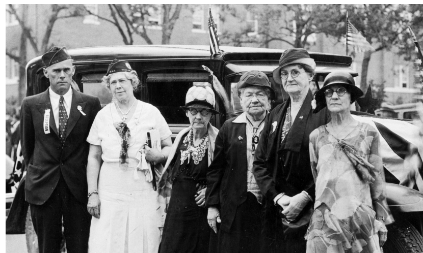
Gold Star Mothers, Waco, Texas

Gold Star pins were custom-made in different styles and sizes prior to 1947 when the US Congress designated the current version of the Gold Star lapel pin as the official symbol